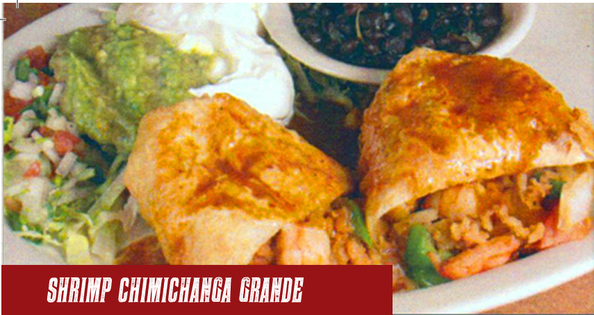
SHRIMP CHIMICHANGA GRANDE